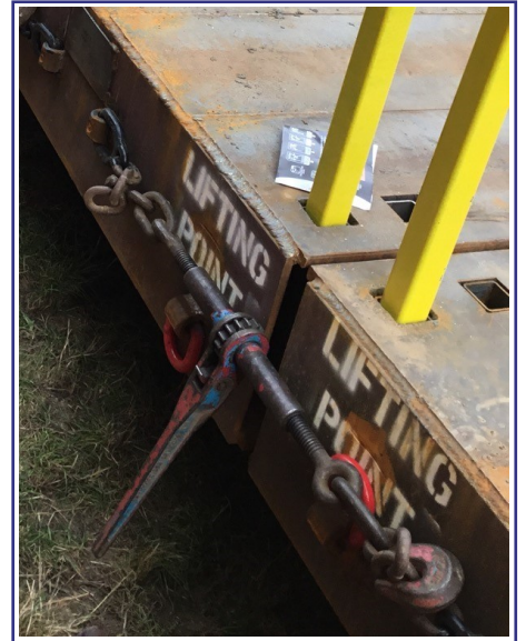
Chain ratchet close-coupling system